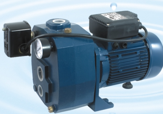
DDP m -505A