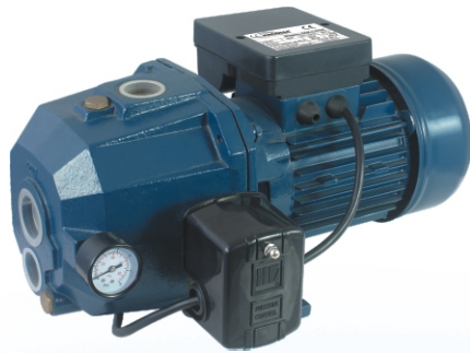
DDP m -255A